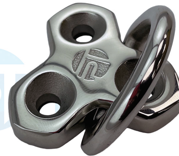
3 Positions Of The D Ring using the same mounting holes